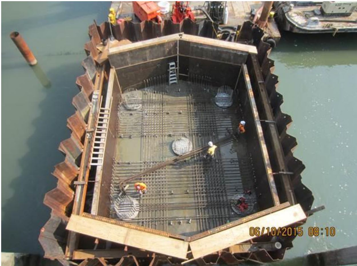
Placement of Reinforcing Steel for the concrete cap at Pier 3

Over the next two weeks, the bridge contractor will;