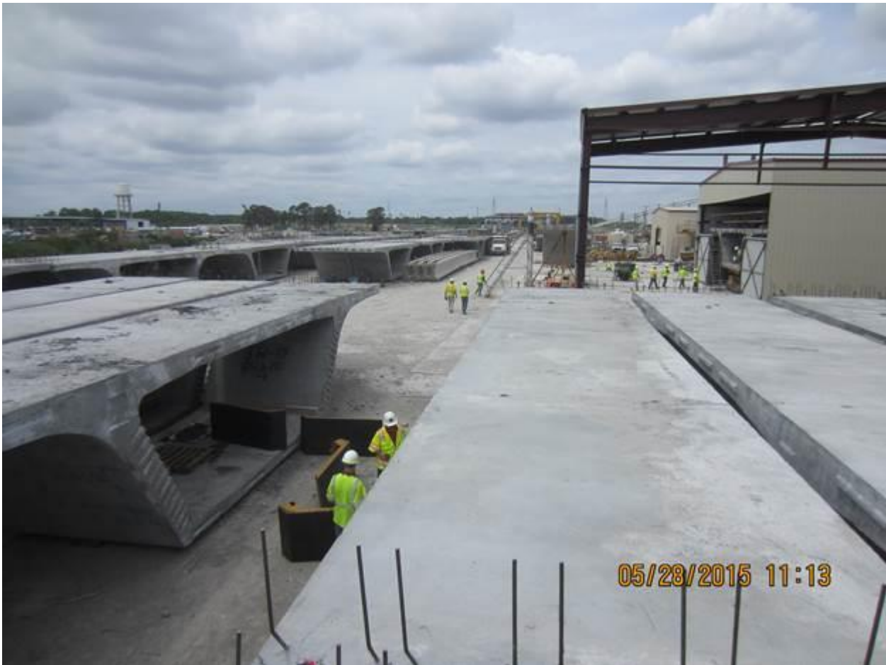
Placement of Reinforcing Steel for the concrete cap at Pier 3

As the segment launcher (gantry crane) comes together between piers 1 and 2 of the new westbound bridge, the casting yard is preparing the completed bridge segments for shipment. A total of 49 of the 177 bridge segments have been cast and is enough to complete 3 of the 10 spans in the westbound bridge. The first bridge segment to be placed will be the expansion joint segment. This segment will be installed on Abutment "A" near 3556 On the Bay condominiums and will likely take place the first week of August 2015. Remember to check out the Lesner Bridge Construction Sequence Animation on YouTube!