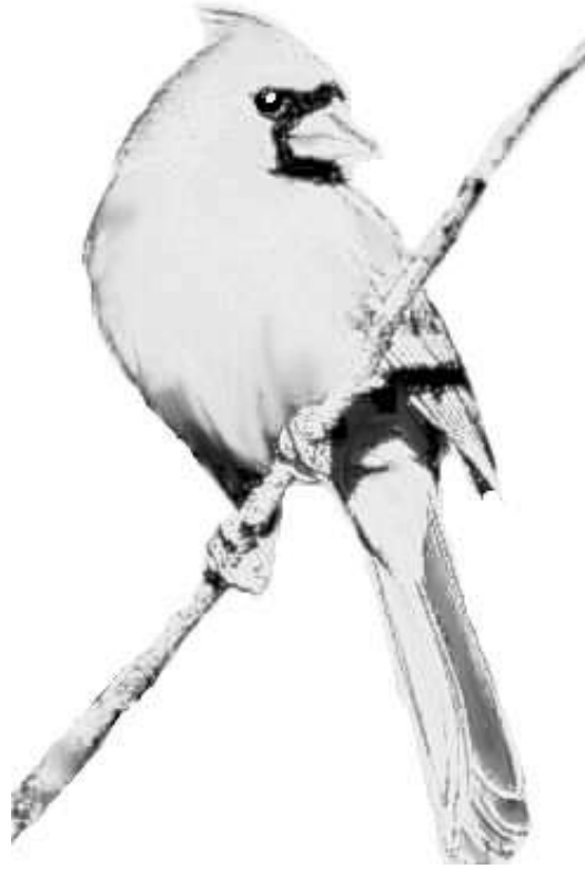
State Bird – Cardinal