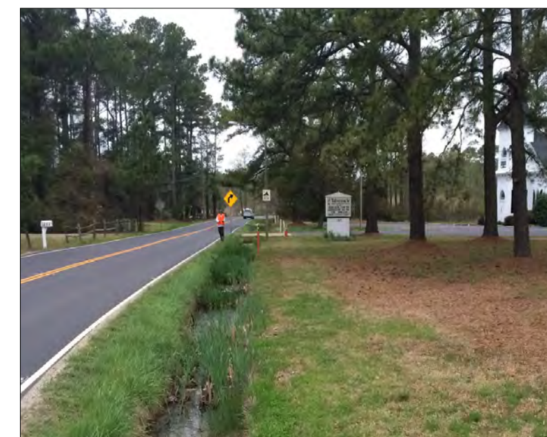
Sandbridge Road Roadway Network