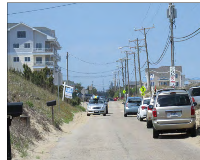
Sandfiddler Road Roadway Network