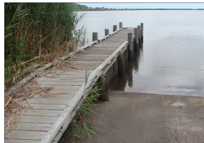
Back Bay Landing Water Access

Canoe/kayak access points, as well as a smaller number of boat ramps, exist around the perimeter of Back Bay (fourteen sites as shown in Figure 4.1). These range in condition from dirt and gravel kayak slides with limited parking to wooden docks and ramps with large parking areas. These launches and boat ramps are fairly well distributed around the Bay. The varying conditions and the lack of a consistent signs and wayfinding system limit visitor use of the access points for water-based transportation to BBNWR and FCSP, as well as their ability to simply enjoy the water resource.