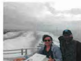
MBC Chair and Vice Chair makes a trip out to the Wind Farm for an update tour.

from 2020 through the end of 2026, the project will support about • 900 direct and indirect Virginia jobs annually (about 60 percent in Hampton Roads), with almost • $57 million in pay and benefits, and over • $143 million