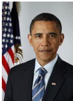
Barack H. Obama