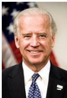
Joseph R. Biden, Jr.